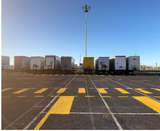
Location for Trailers & Containers